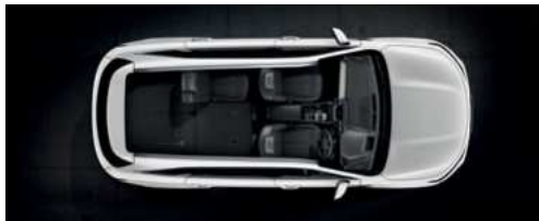
3 rd row folded fully flat and 2 nd row partially folded