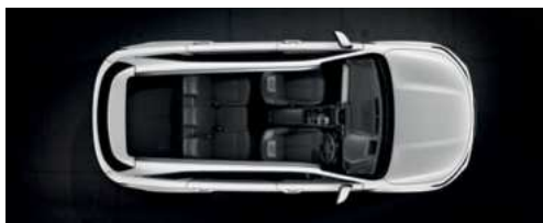
3 rd row folded fully flat