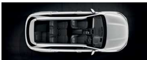
3 rd row partially folded