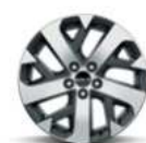
18" alloy wheel