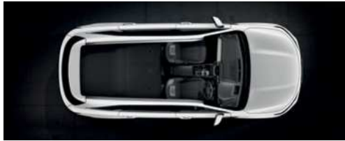
2 nd row folded fully flat

When your head says, "let's push boundaries", the Sorento says, "let's do it in style". That's why you'll find the ultimate in comfort, space, and flexibility wrapped inside its bold exterior design.