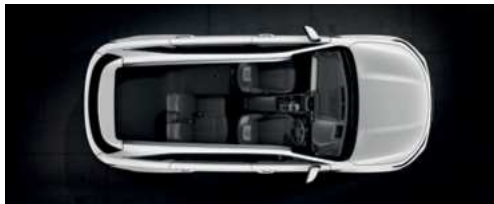
2 nd row partially folded