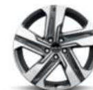
19" alloy wheel