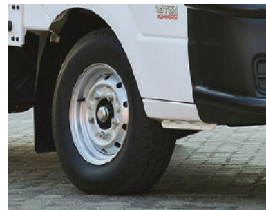
5.0 J x 14" (K2700)