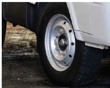
5.5 J x 15" (K2500)