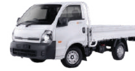
K2700 WORKHORSE TIPPER